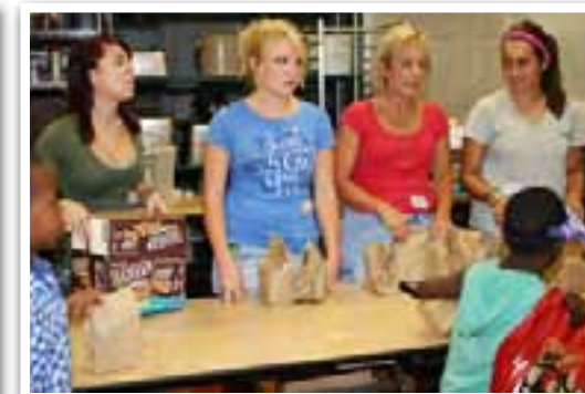
Above ▲ Volunteers give the children goody bags with snacks as they leave.