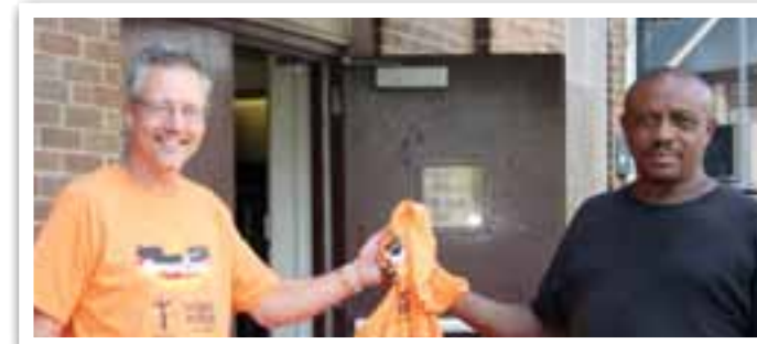
Bottom: Due to the cancelled Walk Run, St. Ben's had t-shirts for union members to give out to guests.

With many members involved in the preparation and serving of food, it should be no surprise that United Food and Commercial Workers (UFCW) Union Local 1473, wanted to help feed the hungry and homeless.