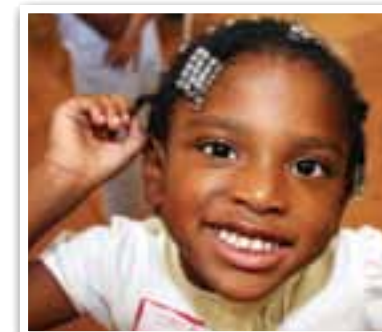
Above ▲ A young guest smiles in anticipation of receiving school supplies and books.