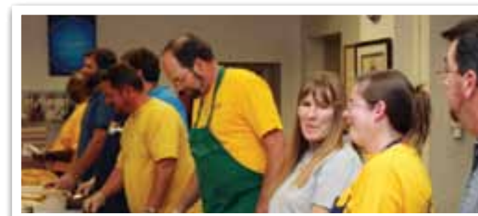
Top: Members of Union Local 1473 prepare to serve dinner at St. Ben's.